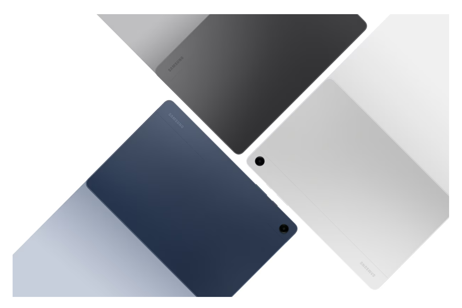
*Galaxy Tab A9 are available in Graphite, Silver and Navy. Colour availability may vary by country or carrier. **Galaxy Tab A9's thickness is 8.0mm.